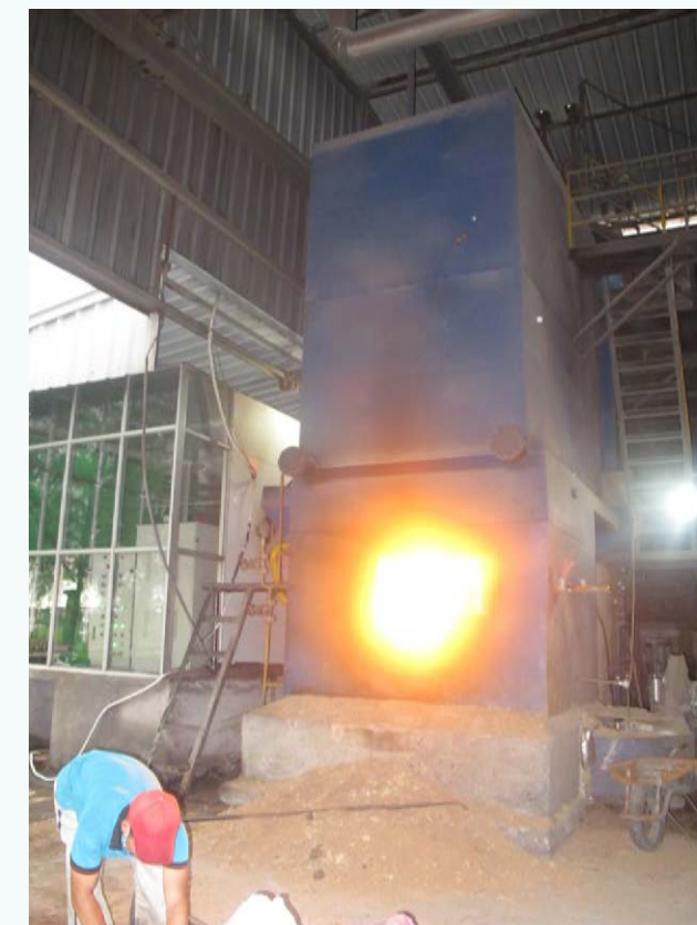
Photo: Coal-biomass co-fired fluidized bed boiler HT Vina.

"The management of HT Vina Investment JSC is committed with high quality cardboard packaging boxes supplied to clients while strive to minimize the impacts to surrounding residential area."