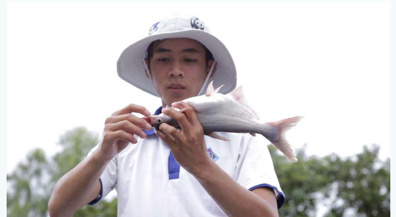
Photo: Research on pangasius farming at the model farm. Source: VNCPC.

There were 20 study tours to the model farm with the participation of 500 technical staffs of SMEs and local fisheries departments representatives.