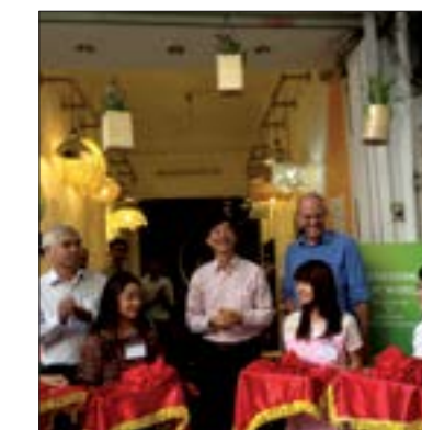
Opening ceremony of Green Street Showroom (Hanoi)