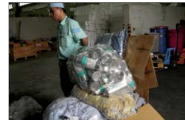
Transporting sorted wastes from factory to collection point by Canon Inc.

- Viet Nam – Singapore Industrial park (VSIP): Since the establishment in 1996, VSIP has become a symbol of the cooperation between Vietnam and Singapore, and considered as one of the most successful IP in Vietnam from sustainable development perspective. In addition to significant economic contribution, the IP management team also pays a lot of attentions on environmental protection (achieved ISO 14001 certification, Green Technology Award from Vietnam Association for Conservation of Nature and Environment) and social responsibility (OHSAS 18001 certification, creating the VSIP Charity Fund, establishing the Vietnam Singapore Technical Institute (VSTS) to enhance the technical expertise for the Vietnamese workforce in the area, etc.).