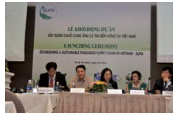
Project's partners answering questions from interested delegates

Participants of the kick-off workshop (Can Tho, July 29 th – 30 th , 2013) discussed and agreed on the implementation plan to achieve project's objectives. Enterprises' representatives, researchers from Faculty of Fisheries and Faculty of Environment (from CTU), representatives from Vietnam Pangasius Association, Vietnam Fisheries Society, government offices in the Mekong Delta region were invited for advising project implementation.