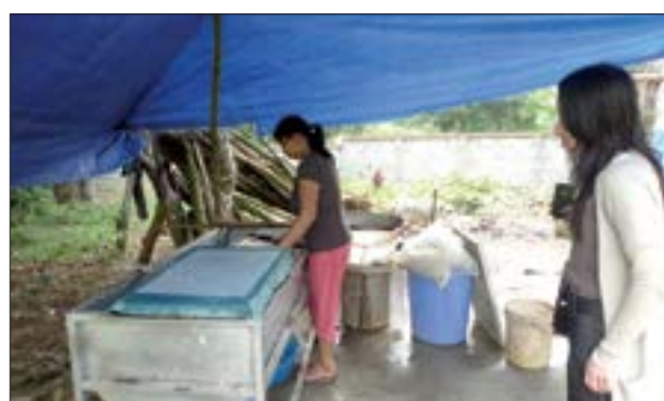
Stainless steel dó paper making machine