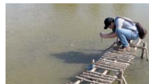
Performing on-site assessments