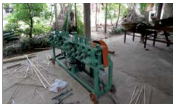
Outer layer splitting machine for bamboo