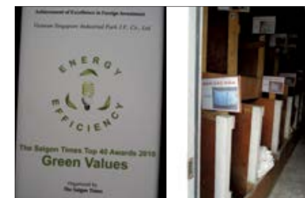
Repository of segregated solid wastes in Yakult company

- Viet Nam – Singapore Industrial park (VSIP): Since the establishment in 1996, VSIP has become a symbol of the cooperation between Vietnam and Singapore, and considered as one of the most successful IP in Vietnam from sustainable development perspective. In addition to significant economic contribution, the IP management team also pays a lot of attentions on environmental protection (achieved ISO 14001 certification, Green Technology Award from Vietnam Association for Conservation of Nature and Environment) and social responsibility (OHSAS 18001 certification, creating the VSIP Charity Fund, establishing the Vietnam Singapore Technical Institute (VSTS) to enhance the technical expertise for the Vietnamese workforce in the area, etc.).