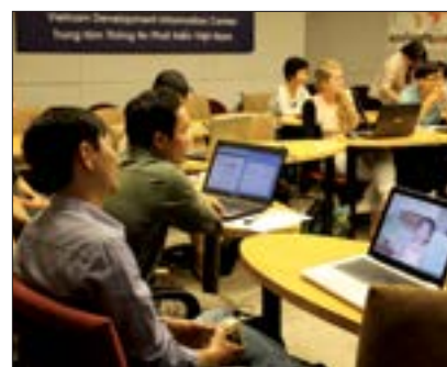
TOT in Hanoi, 2-3/10/2013

A training-of-trainer course within the SPIN-e project framework was organized in order to improve the competency and skill on CP and SPIN implementation for SMEs and consultants.