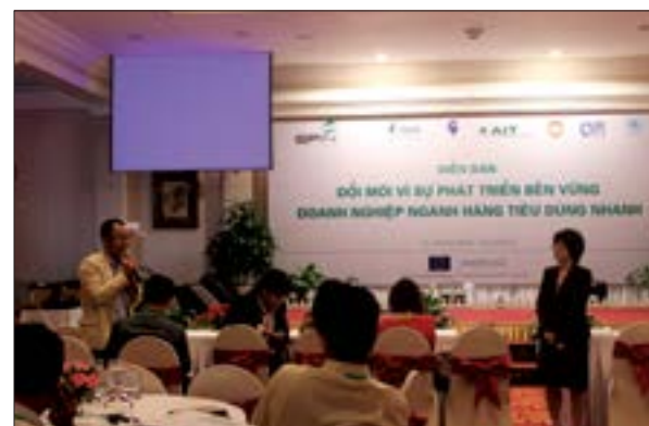
Workshop on Innovation for Sustainable Development of the enterprises in Fast Moving Consumer Goods sector (Hanoi)