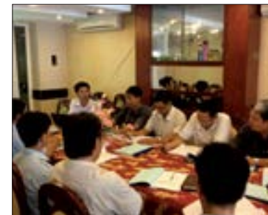
Training for Rice sector