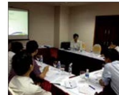
Training for Coffee sector