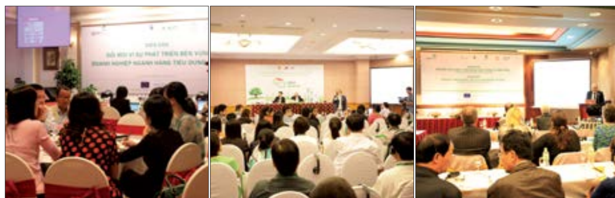
SPIN-e introduction events