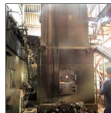
Existing coal-fired boiler