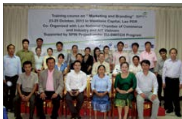
Training on marketing and branding for enterprises and consultants (Vientiane)