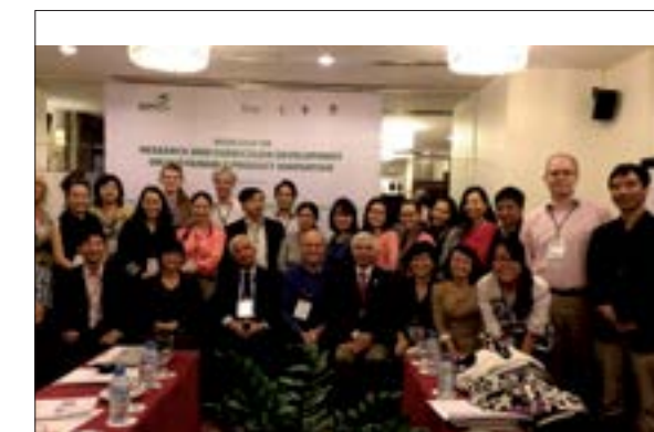
Workshop on "Research and curriculum development on SPIN"

TUD and VNCPC co-organized a workshop on "Research and Curriculum Development on Sustainable Product Innovation in Vietnam" with participation from 10 professors, PhD students from TUD, and 20 lecturers in designing field from HUST and AITVN. The workshop provided an opportunity of experience share on SPIN research and teaching in the Netherlands for HUST lecturers to put sustainable factors in their curriculum, as well as helping AITVN develop training courses on sustainable product innovation for Vietnamese industry.