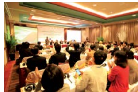
SPIN project's dissemination workshop

"Production Innovation - Key to Sustainable Future" workshop, which held by VNCPC to summarise activities, experiences and success stories from 4 years of project implementation, drew attention of 150 representatives from organizers, development organizations, embassies, universities, businesses and collaborating organisations of the project and press agencies. Participants highly appreciated the efforts and achievements by partners involved in the project, especially VNCPC and AITVN, and expressed the expectation that project's partners continue to promote SPIN as well as sustainable consumption in Vietnam in coming future.