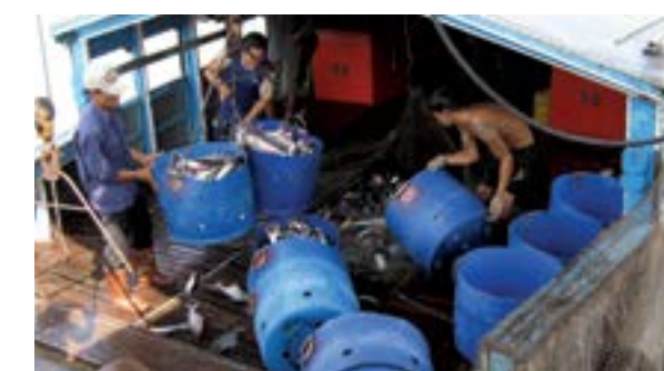
Collecting and transport pangasius