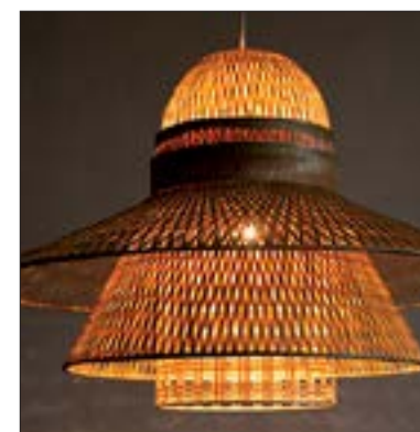
Bamboo lamp shape of Duc Phong Company (Nghệ An province)