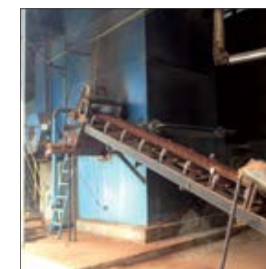
Newly-installed biomass fluidized-bed boiler