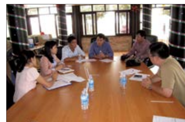
Working with enterprises' staff in charge of farm