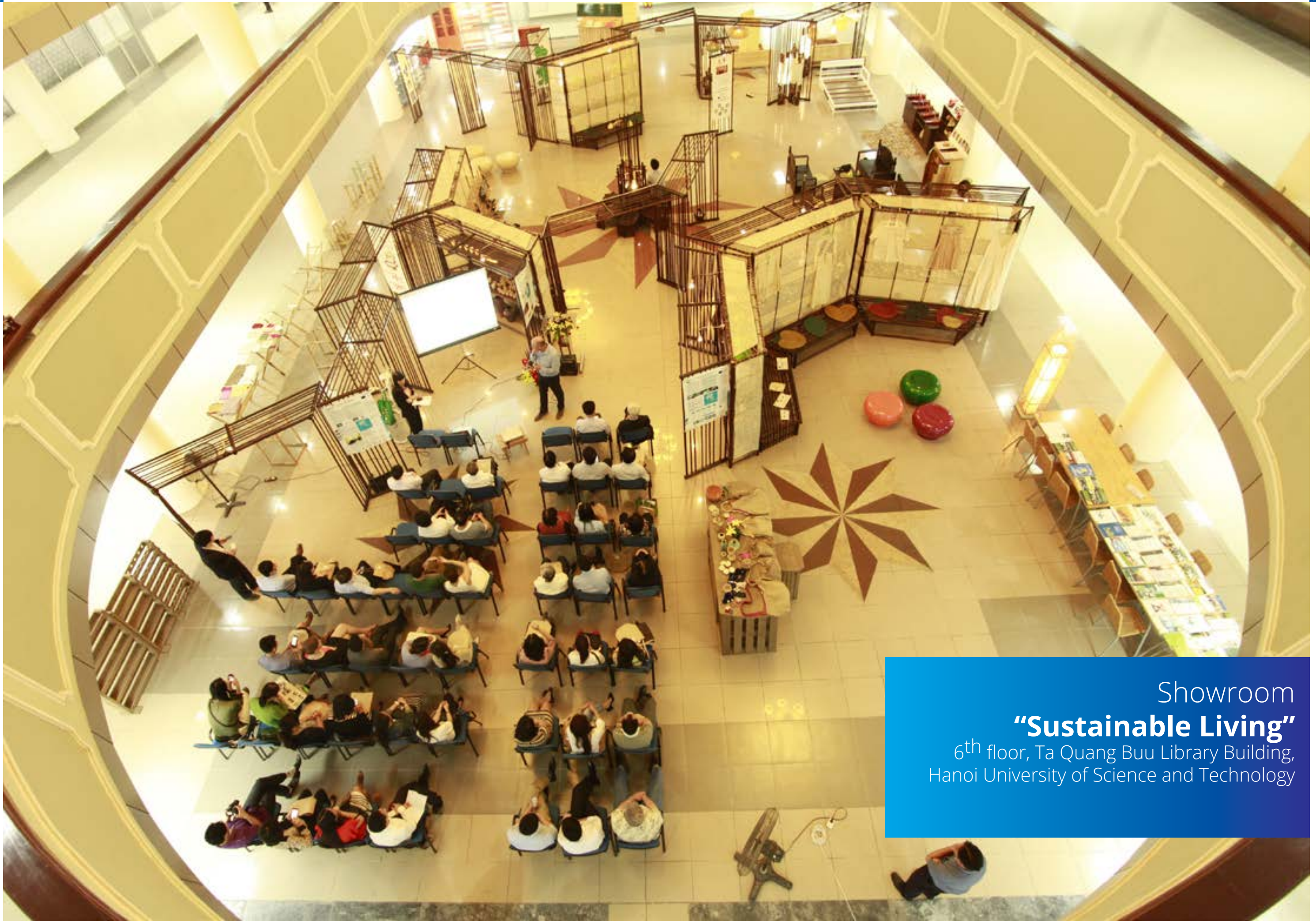
Showroom “Sustainable Living” 6 th floor, Ta Quang Buu Library Building, Hanoi University of Science and Technology