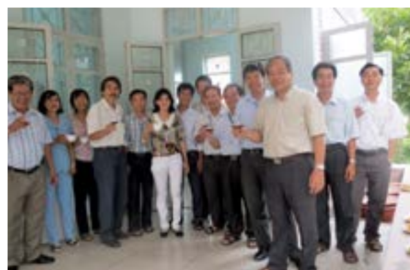
The Project Office opening ceremony

The Office is located on the campus of the CTU under the Faculty of Fisheries. At the moment, there are 4 staffs working full time.