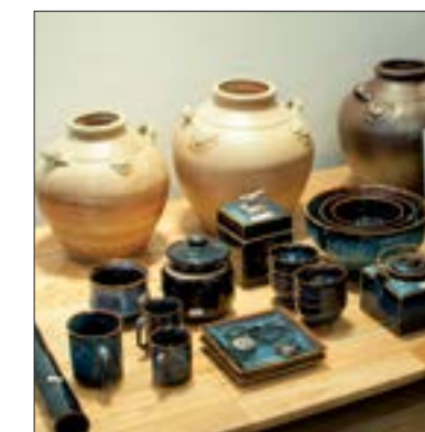
Set of ceramics of Dong Gia Company (Hochiminh City)