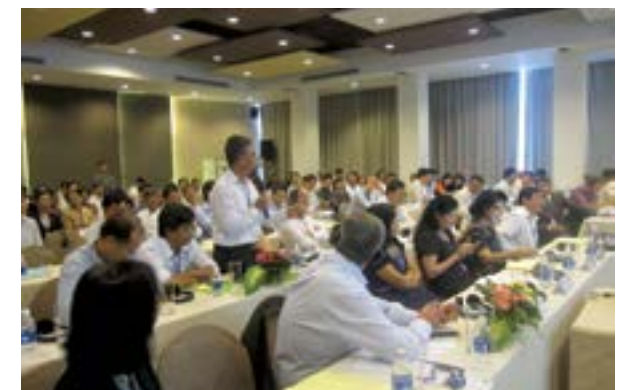
Information exchange with enterprises