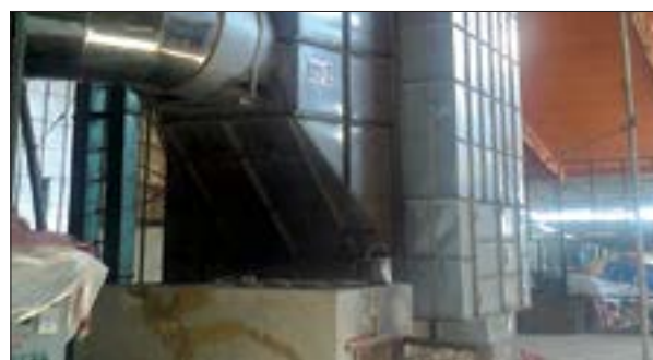
Coffee drying after RECP