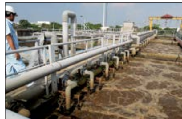
Concentrate wastewater treatment system using membrane and microbial technology at TLIP