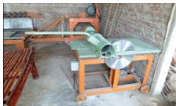
Toothpick cutting machine

These machines have been put into operation in households/enterprises and appreciated in terms of technical, economic and environmental improvement.