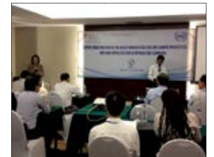
Expert Group Meeting in Hanoi