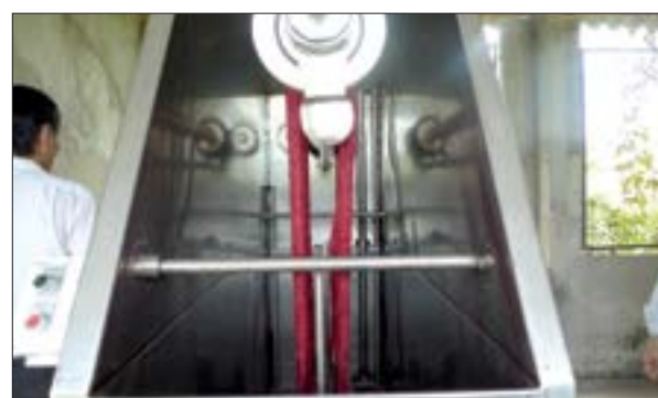
Natural colorant dyeing machine