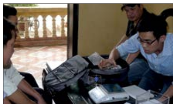
Electronic balance to measure lacquer content