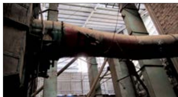
Coffee drying before RECP