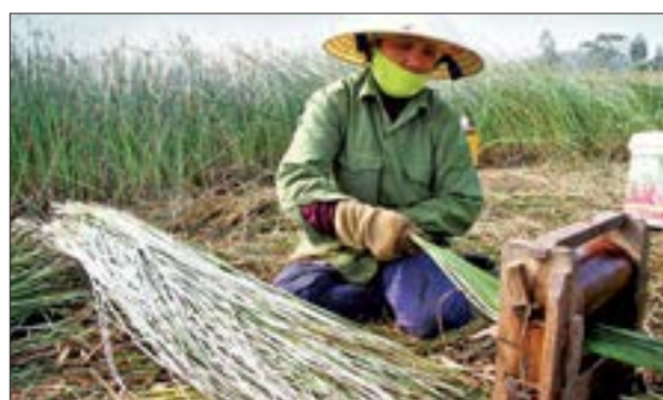
Seagrass splitting machine