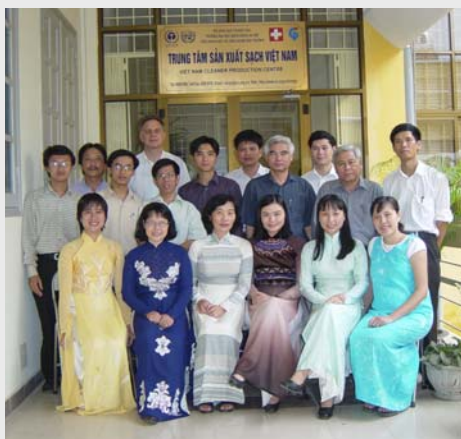
VNCP's staff in front of the new office