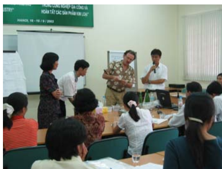
Experiment at a cleaner production intensive training for metal fabricating and finishing industry

The intensive training program, or sector specific training, was organized in combination with in-plant demonstration activities so that participants gained practical experience in Cleaner Production Assessments. The total duration of this training was 15 days of classroom training and between 11 to 15 days of practical work in companies. The program is designed as illustrated in table 2. Between each training module, participants and lecturers work together in the company to gain practical experience. At the end of the training, participants are able to carry out cleaner production assessment in industry and work with a team in a company to develop opportunities to increase competitiveness for the company. They are potential service providers or promoters for cleaner production in Viet Nam.