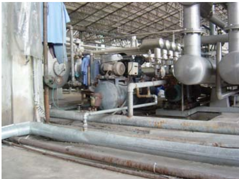
There are still number of companies loose the money by not recycling condensates