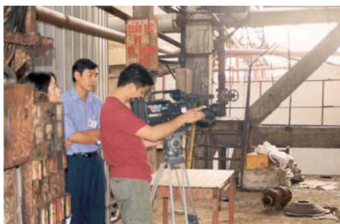
Cleaner production achievements in participating companies are distributed by different media

The vision of Viet Nam Cleaner Production Centre is to play a catalytic and coordinating role in promoting Cleaner Production in Viet Nam.