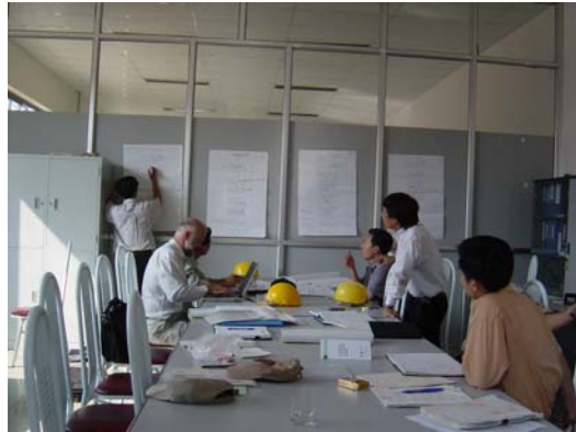
There are kick-off and number of follow-up meetings with the company's staff during the assessment

In 2003, the centre initiated 6 integrated cleaner production programs in over 50 companies. The companies came from textile, pulp and paper, metal products, chemical, food processing, construction material, plastic, wood, beverage, and sugar sectors. By the end of 2003, 15 companies have completed their assessment, and the rest are expected to complete by the end of 2004.