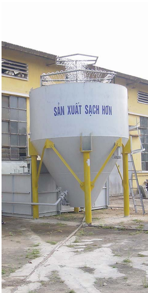
A sign means "Cleaner production" at a participating company

In 2002, the Centre achieved or surpassed the targets set in its business plan. The results of the surveillance audits for ISO 9001 and ISO 14001 proved the stability of the Management System to ensure the quality and environmental performance at the Centre.