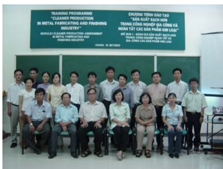
Participants at the sector specific training program 2003