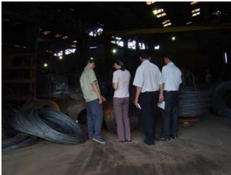
Working at a metal company

Deputy Director, Vinh Phu Textile Company