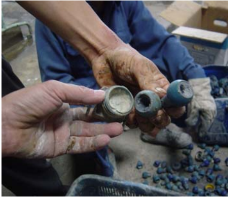
Working at a metal finishing company

Since 1999, together with the team from participating companies, the staff of centre have shown benefits of cleaner production mainly in pulp and paper, textile, metal finishing, construction materials, food processing and beverage sectors. The participating companies have their own resources to maintain the program.