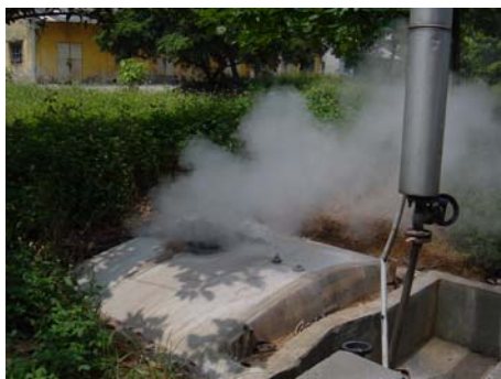
Energy efficiency program proved to bring enterprise significant savings

In 2003, the centre focused its efforts not only on cleaner production assessments, but also on the introduction of energy efficiency and occupational health and safety to the application of cleaner production. Applying the approach of cleaner production assessment to energy efficiency has brought about quite positive results.