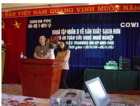
CP & OHS training in Danida's project "Industrial and urban development in Viet Tri city"

There was great demand for tailor-made courses for projects executed by VCEP, UNEP and DANIDA. Beside the introduction to cleaner production and to energy efficiency, the demand of this year focused on related issues such as environmental management systems, energy efficiency and occupational health and safety.