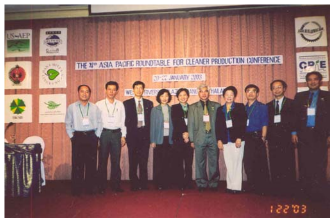
Vietnamese delegation at Asia Pacific Roundtable for Cleaner Production