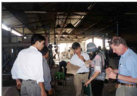
Cleaner production is demonstrated to be advantage in different industrial sectors, different size and ownership of companies