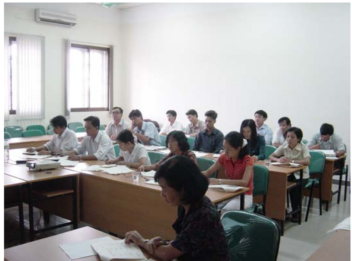
Intensive training course on cleaner production was designed and organized for metal fabricating and finishing

In 2003, the centre focused on building up CP capacity for the metal finishing sector and started providing services to international funded projects in Viet Nam.