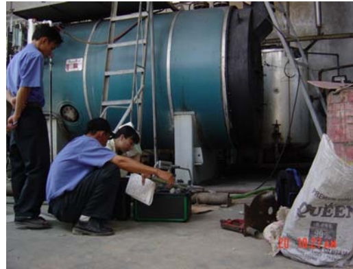
Measurement with combustion analyser can prove the potential of CP immediately at site