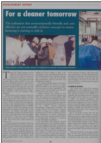
An article in Vietnam Economic Times

In 2003, another two 30-minute spots, “cleaner production in textile” and “cleaner production in pulp and paper”, were shown on National Television channel VTV2 several times. So far, all three spots from Viet Nam Television, including “Introduction to cleaner production” in 2002, are available in both Vietnamese and English.