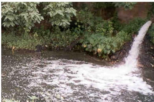
The integrated system will not only help us, but also industrial enterprises to have better and cleaner working environment