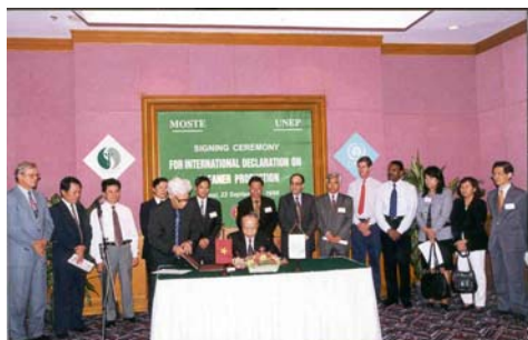
Signing ceremony on international cleaner production declaration by the government of Viet Nam