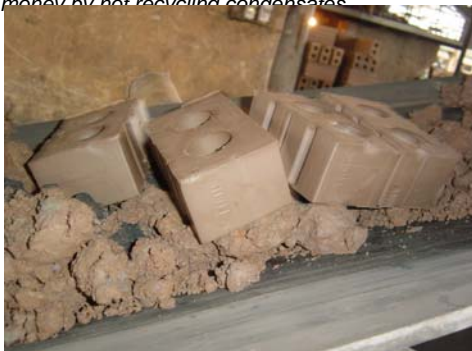
The objective of cleaner production assessment is to reduce material use, reprocessing rate, thus improve production efficiency

The VNCP uses three approaches in carrying out its assessments of companies. They are: