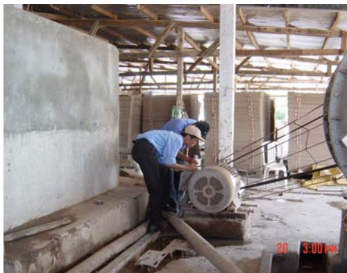
Depending on type of in-company service, the staff of centre might do measurements directly or instruct to the company's team

With a total of 177 man-months (or around 15 man-years) available in 2003, the Viet Nam Cleaner Production Centre carried out about double work load compared to 2002. It organized 22 training courses for 1,957 person-days of training (including 60 person-days training cum study tour), 10 seminars equivalent to 417 person-days, and completed 15 full cleaner production assessments, and a number of other activities described below.