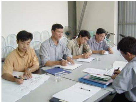
Group work at a training module in Viet Tri city