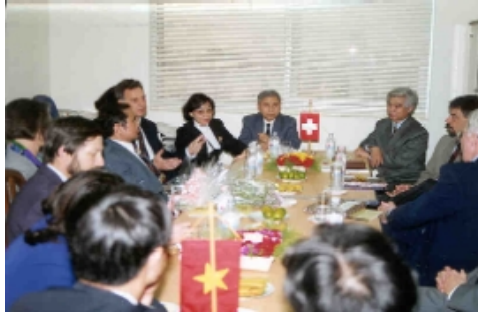
The centre in the first days of its establishment

In connection with the implementation of an Integrated Management System following ISO 9001 and ISO 14001, the Viet Nam Cleaner Production Centre has established and maintained the following Policy for Quality and Environment