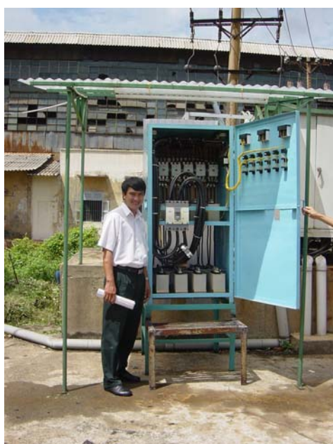
Investment to capacitor is proved to be worthy in many companies

All these benefits were mainly achieved by reduction-at-source measures. Due to the relatively short period of the implementation (within one year), the full potential of cleaner production is not yet illustrated. However, cleaner production has already proved its advantage.