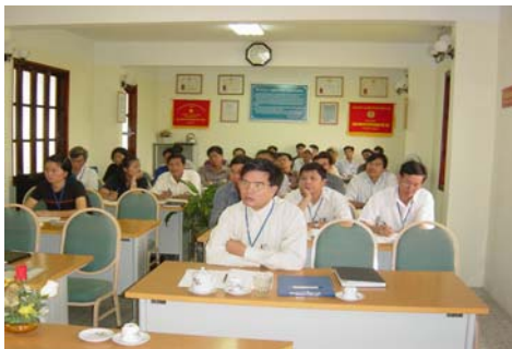
Training in Xuan Hoa Company

The lack of well-trained and experienced cleaner production specialists is one of the main barriers to implementation of cleaner production in Vietnamese industry. Therefore one of the key activities of the centre is to build up, through training, a resource base of national experts on Cleaner Production.