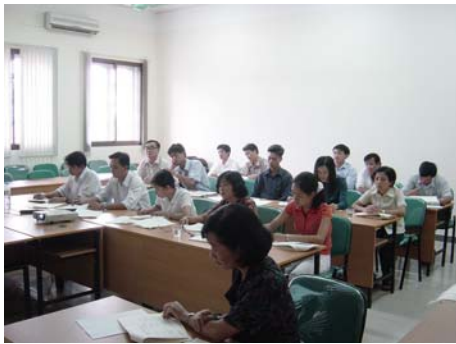
Participants at sector specific training