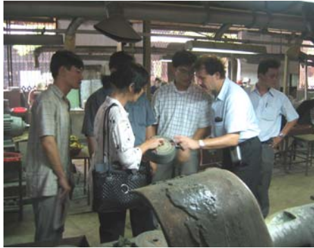
Participants learn in classroom, through company visit, and by working with the CP team at the participating companies