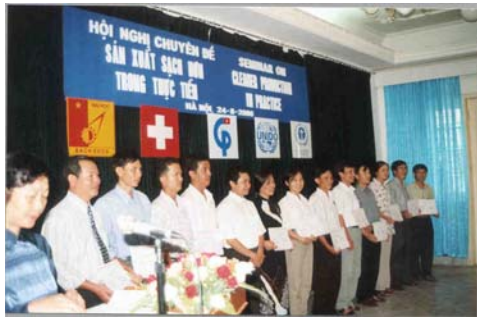
First CP train-the-trainers program in 1999