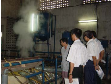
One of the follow-up meeting during assessment

The objective of the in-plant demonstration programme is to show the benefits of cleaner production when implemented in Vietnamese industries. In addition, the in-plant demonstration programme is used to provide hands-on training for the participants of our intensive training programme.