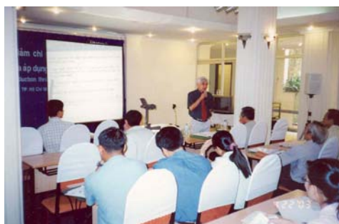
An awareness raising seminar for enterprises of HCMC Industrial Park

In 2003, nine awareness-raising seminars were organised in different provinces. This year, introduction of cleaner production was introduced together with other environmental management tools to industries, academic and research institutions as well as governmental officials.