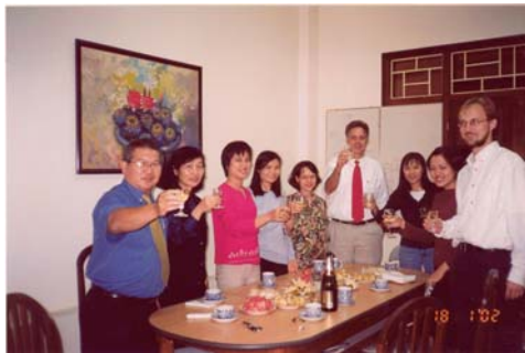
Our Centre was certified to ISO 9001 and 14001 in 2002